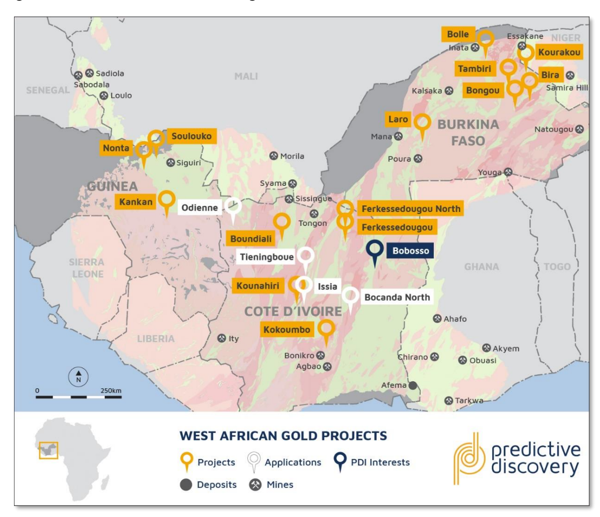
Figure 1 - Location of Predictive Discovery's West African Gold Projects

The Company has interests in approximately 5,000km<sup>2</sup> of prospective landholdings across the world-class Birimian greenstone belts of Cote D'Ivoire (Figure 1).