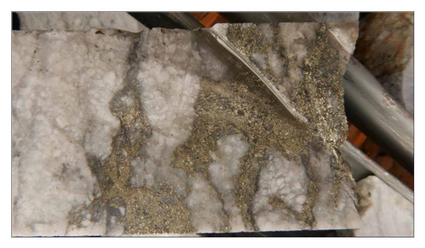
Figure 4 – Ferkessedougou North – pyrite-mineralised gold-bearing altered granite.